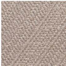
06 DOVE GREY