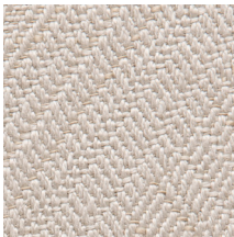
03 LIGHT ASH