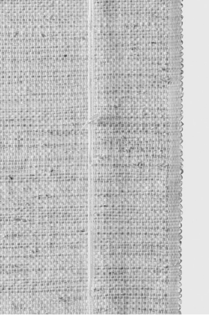
Ladder tape (back view)